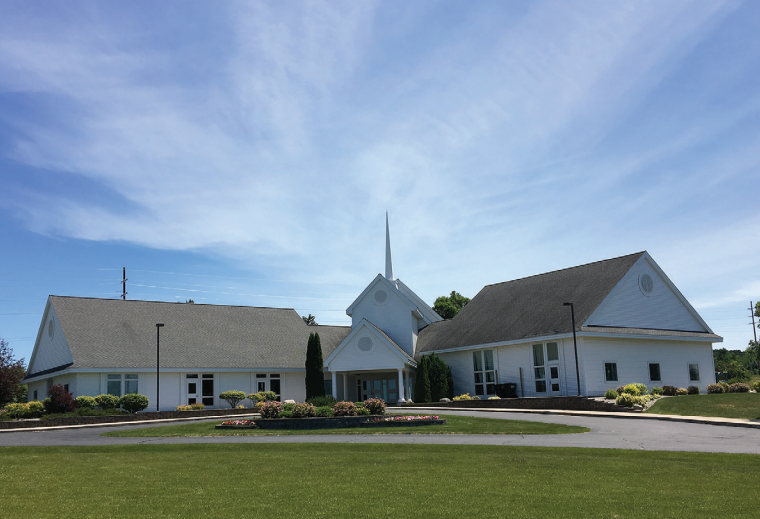
▲ Traverse City Church