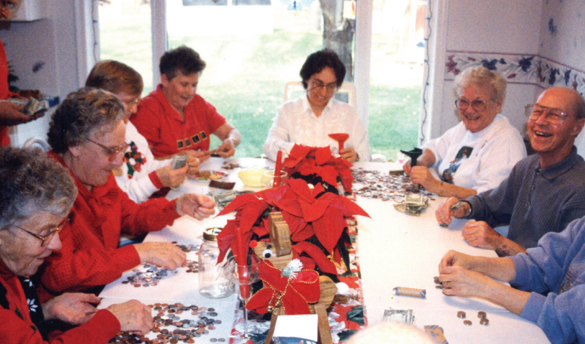
▲ Lansing Sabbath School Class